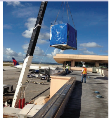
New energy efficient cooling systems replace old terminal cooling equipment.

The Energy Management Program is the Airport's foray into sustainable management of resources and stewards of the environment.