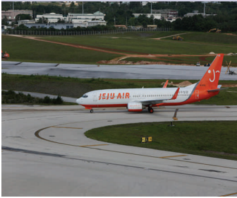
Guam welcomes Jeju Air to its family of airlines. Jeju Air commenced services on the Guam/Seoul route on September 28, 2012.

2012 was a banner year for flight options for Korean visitors, a fast growing secondary tourist market to Guam.